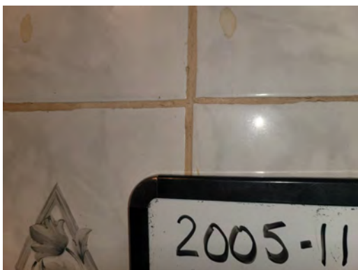
2005-11 Grout Interior Bathroom Wall Tile