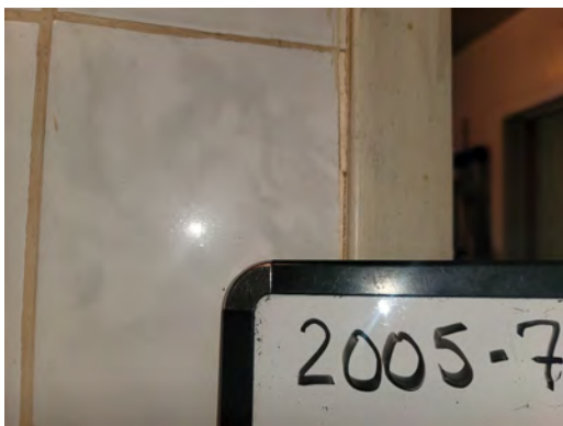
2005-7 Caulk Typical Interior Doors, Windows