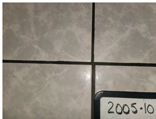
2005-10 Grout Interior Bathroom Floor Tile