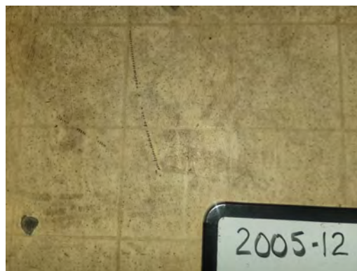
2005-12 Rolled Vinyl Flooring/Adhesive Interior Laundry Room