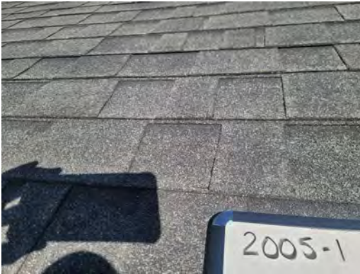
2005-1 Asphalt Shingle/Tar Typical Exterior Roof