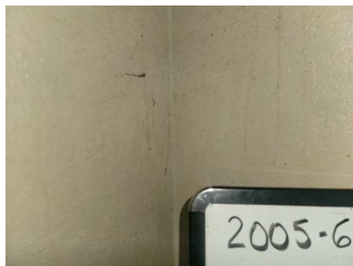
2005-6 Joint Compound/Drywall Typical Interior Walls, Ceilings