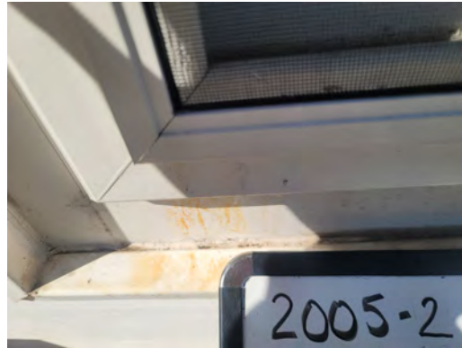
2005-2 Caulk Typical Exterior Windows