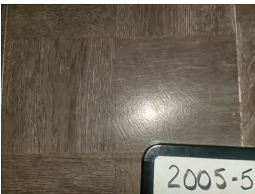
2005-5 12"x12" Vinyl Floor Tile/Adhesive Interior SW Bedroom