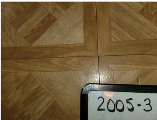
2005-3 12"x12" Vinyl Floor Tile/Adhesive Interior Living Room