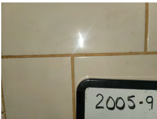
2005-9 Grout Interior Kitchen Wall Tile