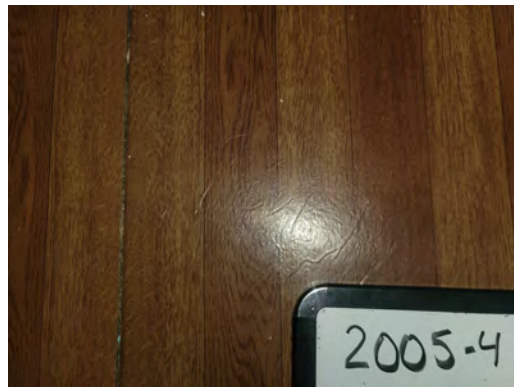
2005-4 12"x12" Vinyl Floor Tile/Adhesive Interior NW Bedroom, NE Bedroom